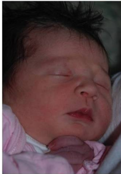
May 21 st , 2011 @ 1:51am 7lb 4oz 19"